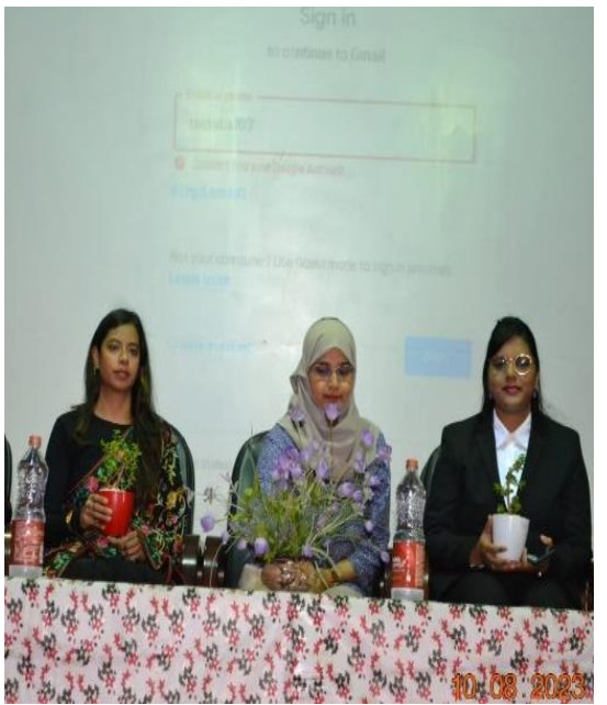
Pictured below are the faculty of members of St Ann's College