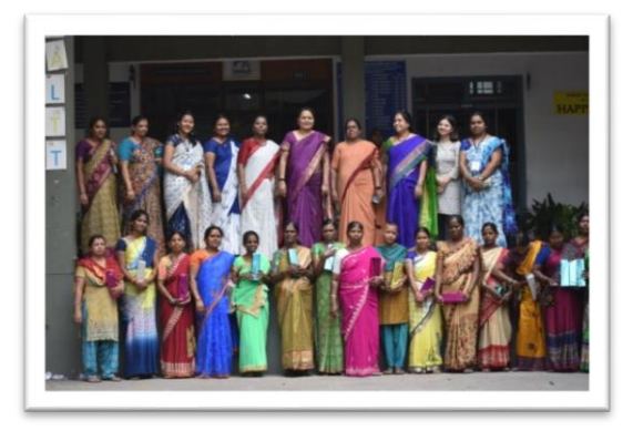
College Auxiliary Staff