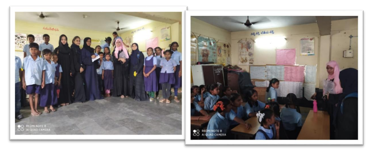
Visited Govt. Primary School, Boja gutta, Asifnagar, Medhipatnam on 11th march 2020