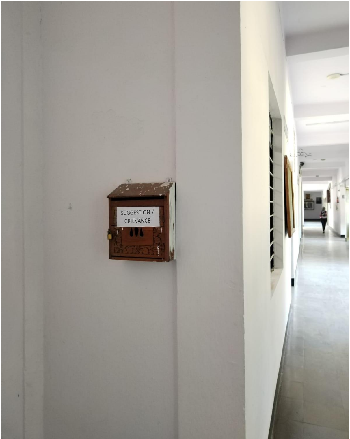
STUDENTS' SUGGESTION/ GRIEVANCE BOX NEAR LIBRARY