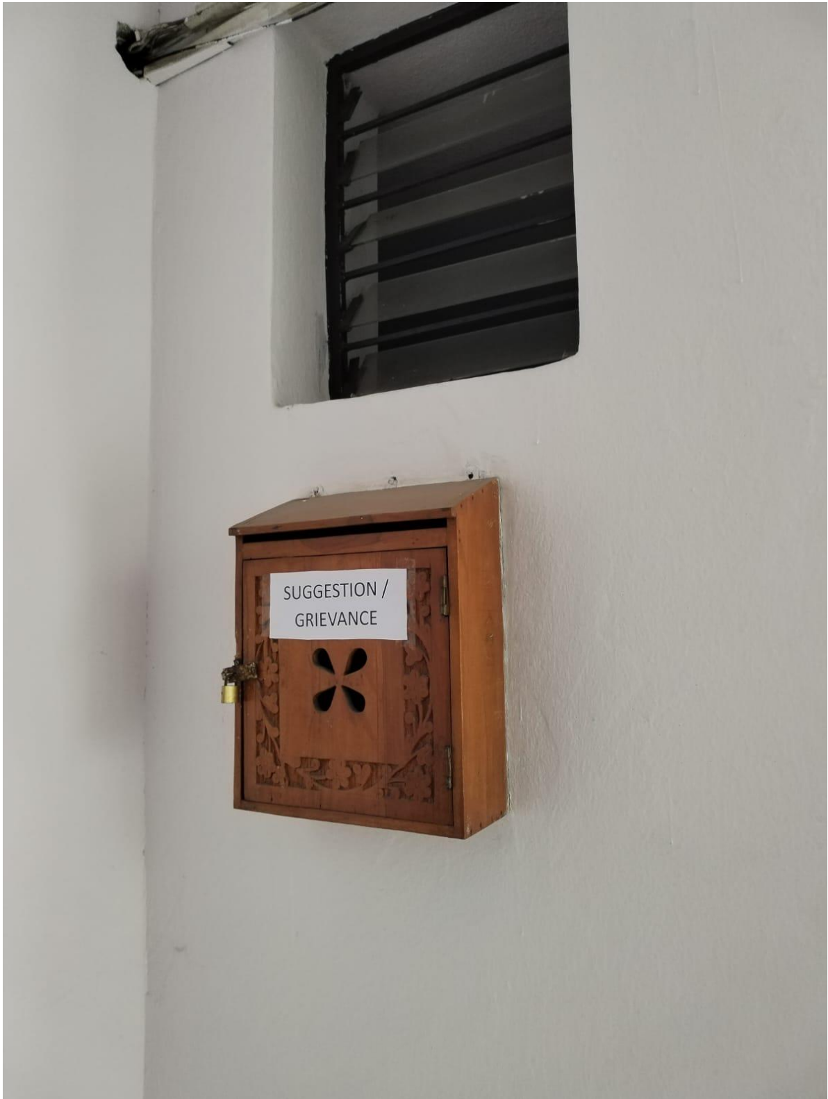
STUDENTS' SUGGESTION/ GRIEVANCE BOX NEAR SISTER PRINCIPAL'S CHAMBER