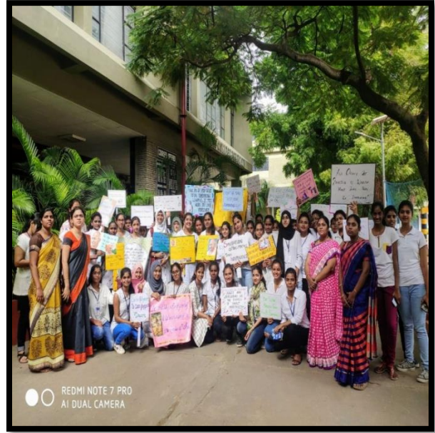
Figure 1Namaste Telangana