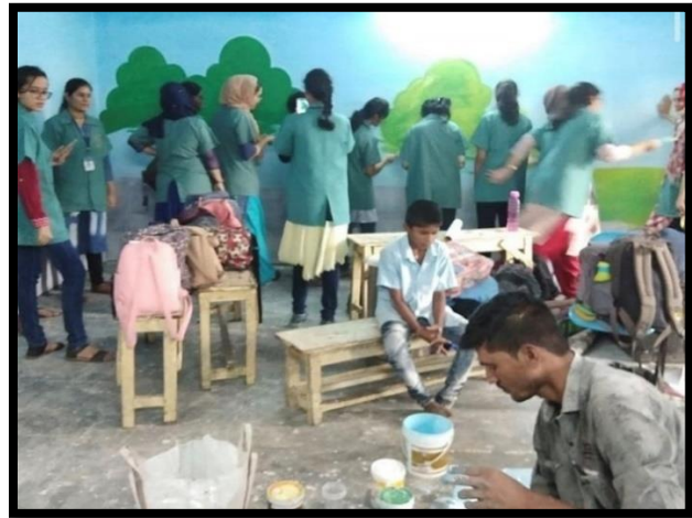
Volunteering for Happy Schools Project