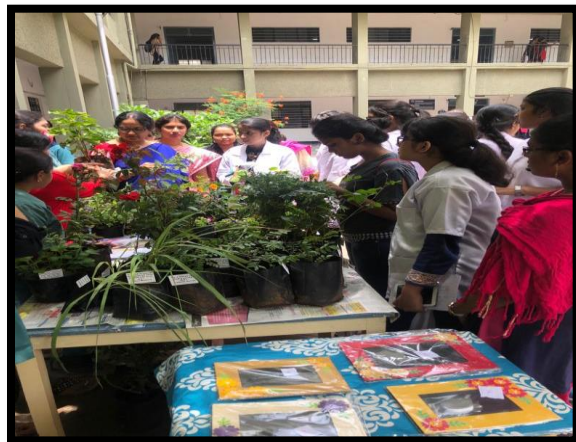
Green Greeting Programme