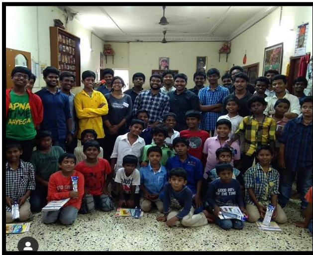
Participation in Daan Utsav at Orphanage