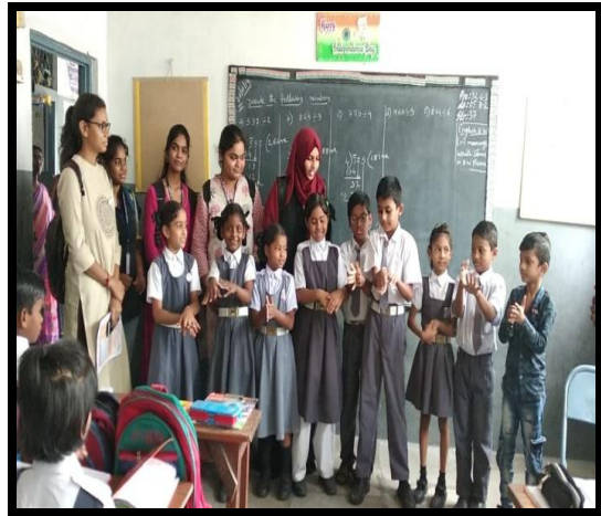
Handwash Campaign at Schools