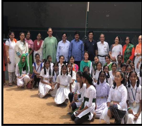
Independence Day Celebrations