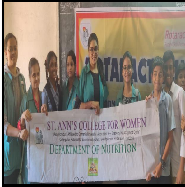
Nutri & Health Camp