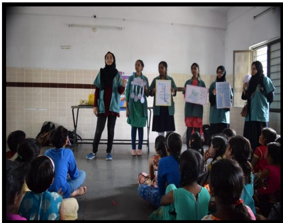
Water Conservation Awareness