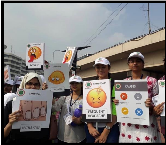
Awareness on Iron Deficiency Project