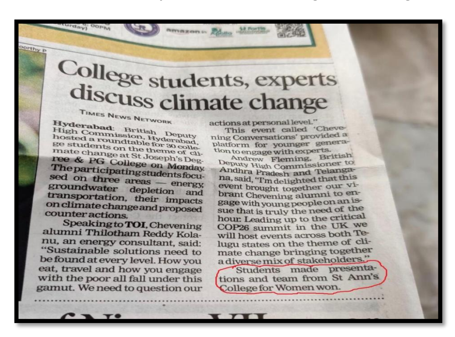
Coverage of the event in News paper