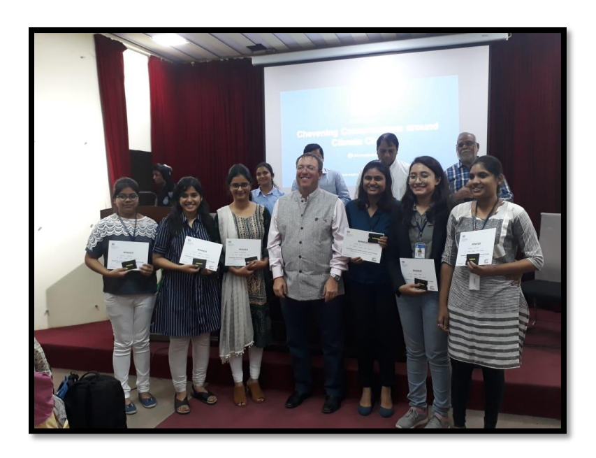
Team of St. Ann's Students secured first position in Climate Change in Intercollegiate Round Table meet