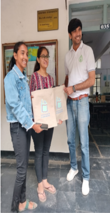
Appreciation from CEO of SWITCH EKO company

St. Ann's College for Women (Autonomous), Affiliated to Osmania University Accredited 'A+' Grade by NAAC (3rd Cycle) College with Potential for Excellence by UGC ISO 9001: 2015-ISO 14001: 2015 Hyderabad- 500028, Telangana, India