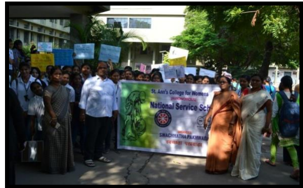
Swachh Pakwada Rally