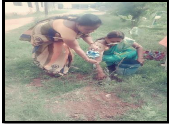
Haritha Haram in Govt. School

Swachh Pakwada Rally was Organized on in the Santhosh Nagar Colony 27-09-18