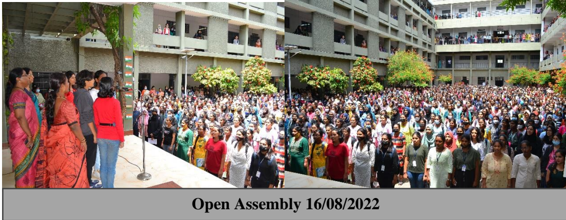
Open Assembly 16/08/2022

attendees. An insightful gathering reinforcing our commitment to virtue and integrity.