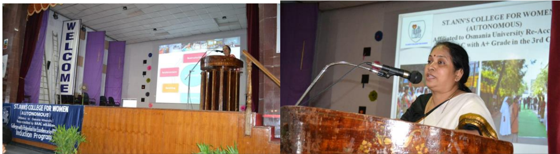
Induction Programme on 20/06/2019

The college induction program emphasized code of conduct: respect for all, academic integrity, responsible communication, professionalism, diversity and inclusivity, personal responsibility, campus care, health and safety, and substance policies, and social responsibility. Students were encouraged to engage in clubs and activities while upholding the code.