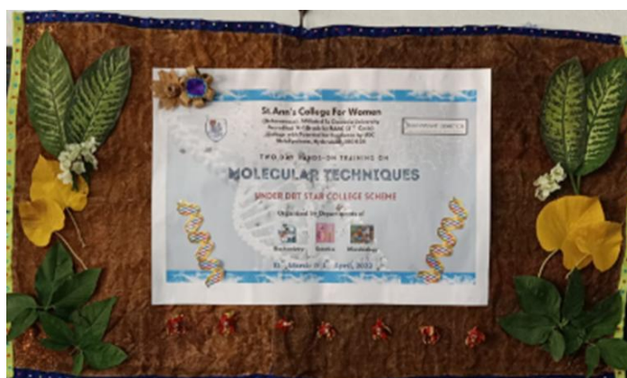
Banner made out of Gunny bags and paper

Prakrithi Ki Pramithi -Designing Eco Banners from gunny bags, jute and textile waste to replace PVC banners.