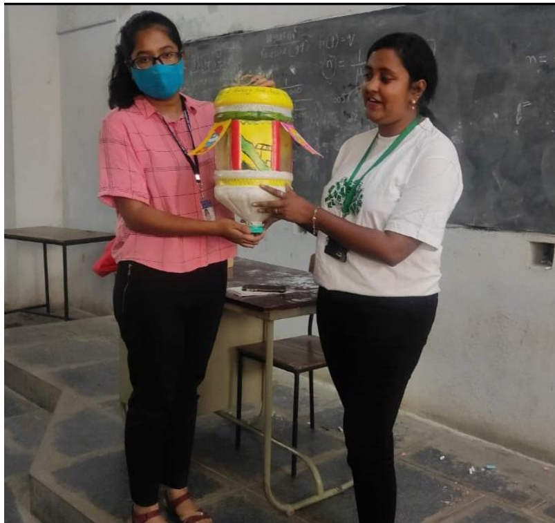
Bird Feeder made with Mineral water can