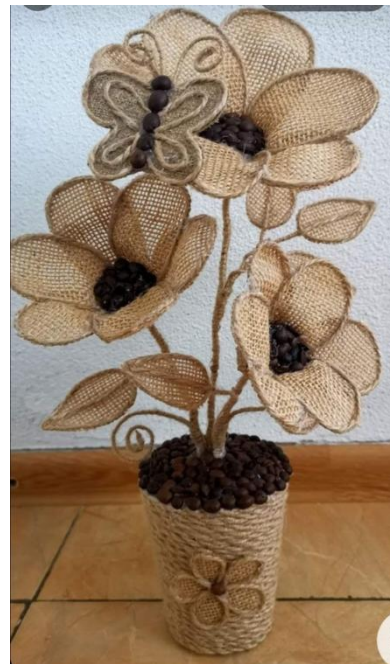
Jute flower vase