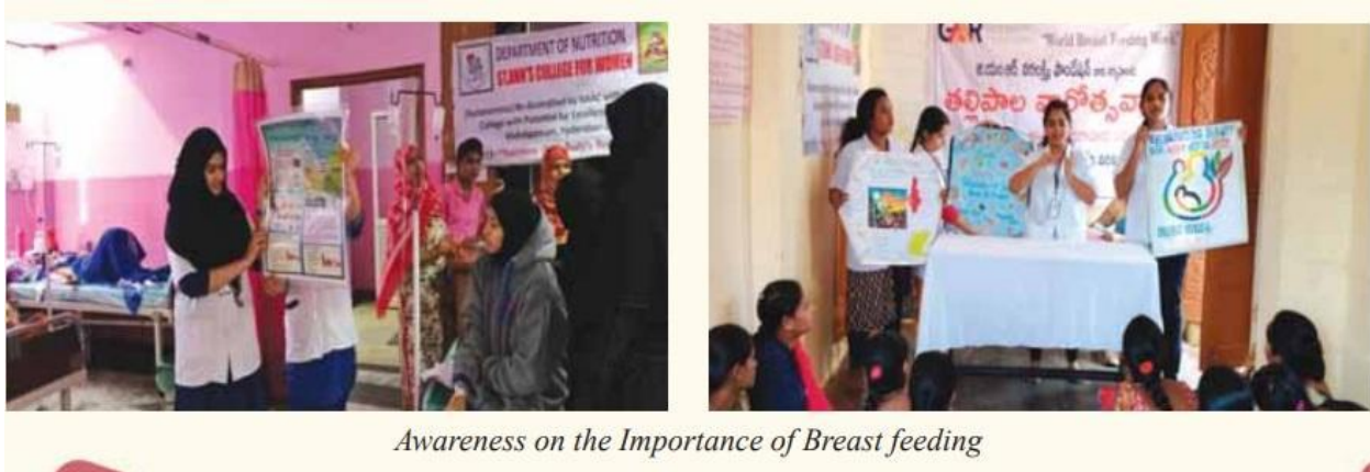
Awareness on the Importance of Breast feeding

World breast feeding week: As part of world breast feeding week during 1-7th aug 2019, the pregnant and lactating mothers in the month of august at various locations in hyderabad like maternity hospitals, anganwadi centres and women organizations.final year students conducted 13 awareness programmms on “importance of breastfeeding”.