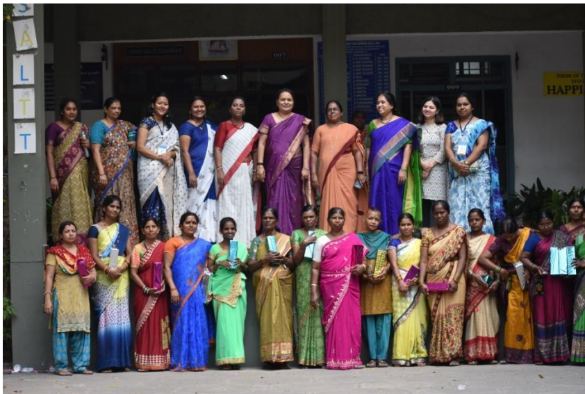
College auxiliary staff