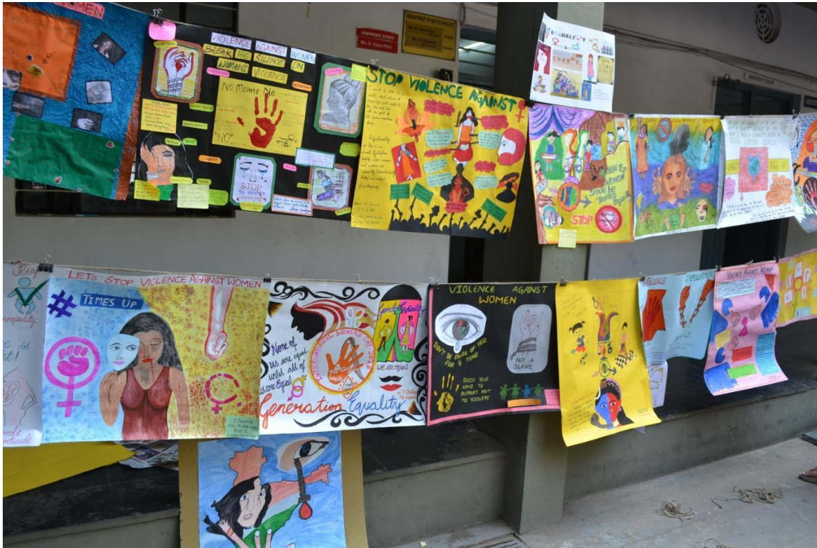
List of Resource Person