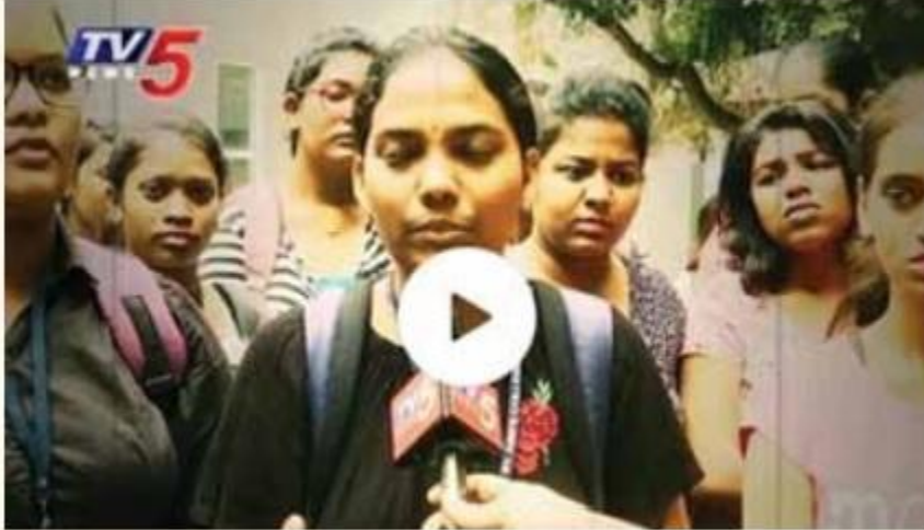
Students being interviewed

Outcome: This program made the students think of what initiative an individual and the Police should take and steps to prevent such incidents in future.